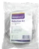
Resplensz ® Nebulizer Kit with Mouthpiece