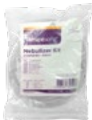
Resplensz ® Nebulizer Kit Standard Pedia