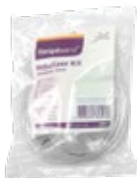
Resplensz ® Nebulizer Kit Standard Adult